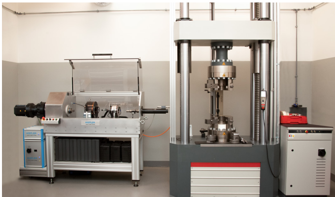
Thanks to its laboratory equipped with the new Analyse system from Kistler (left), REYHER can now carry out even more extensive testing to meet its customers' increased quality requirements.

processes – and end-to-end traceability of the production history is generally required as well.